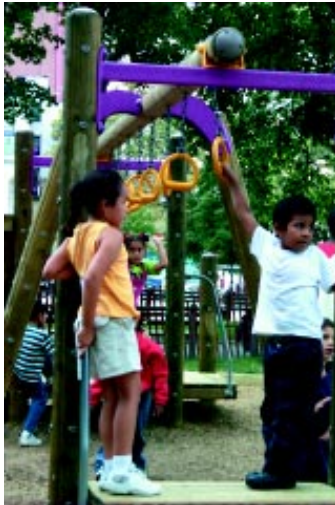
Poe Park jungle gym